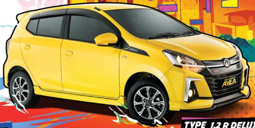
TYPE 1.2 R DELUXE

DESAIN & FITUR BARU DAIHATSU AYLA BIKIN LO MAKIN STYLISH & NYAMAN BIAR LO SERIUS SERUNYA!