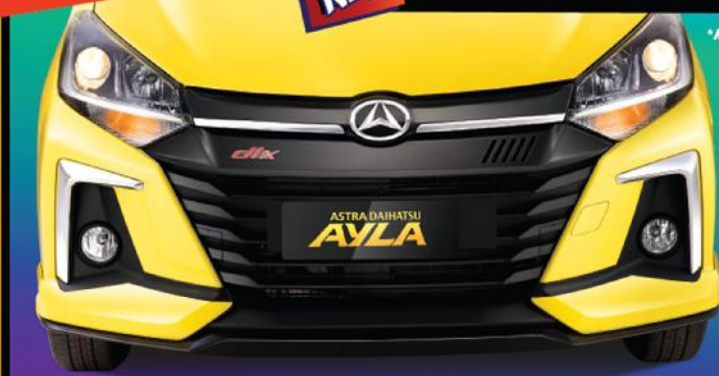
* MULAI TIPE 1.2 X