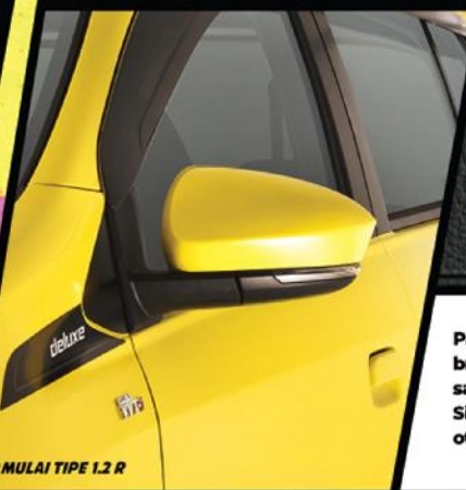
* MULAI TIPE 1.2 R