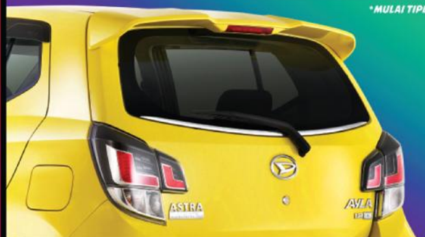
* MULAI TIPE 1.2 R