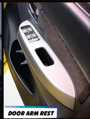
DOOR ARM REST