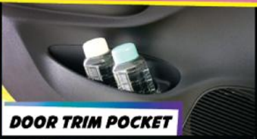
DOOR TRIM POCKET