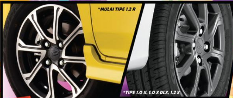
* MULAI TIPE 1.2 R