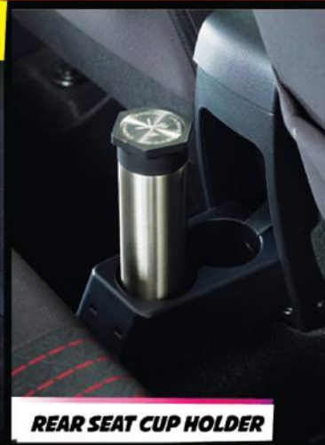
REAR SEAT CUP HOLDER