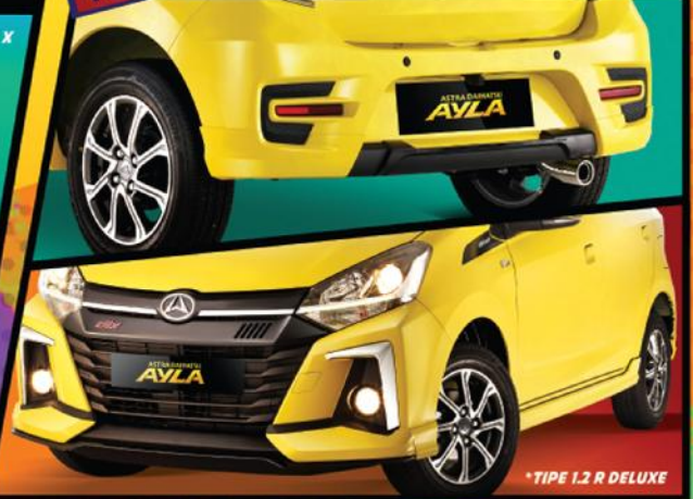
* TIPE 1.2 R DELUXE